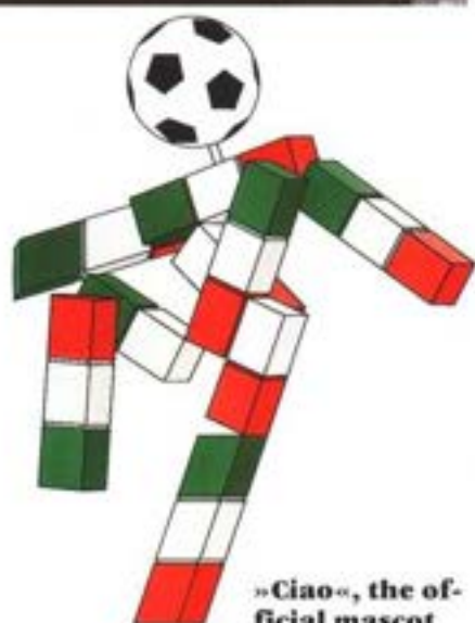
»Ciao«, the official mascot

FIFA considered it unnecessary to declare any one of the six posters as the official one. Which one is the best? Difficult to answer. If a decision is to be made, it must be left to the observer.