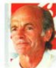
Dettmar Cramer (Federal Rep. of Germany)

Born on 5 August 1931. Played amongst other clubs for Sunderland, Everton and Luton Town. Bingham began his coaching career with Linfield. Following this he became coach of the Greek national team. With various stops on the way (including a spell at Everton) he once again for the second time after 1967 took over the Northern Irish side and qualified with them for both the 1982 and 1986 World Cups. His first commission in the framework of the Technical Study Group was in 1983 on the occasion of the WYC in Mexico.