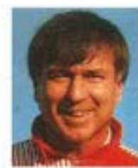
Sepp Piontek (Federal Rep. of Germany)