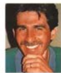
Carlos Queiroz (Portugal)

German national team. His coaching career took him via his first club, Fortuna Düsseldorf, the national squad of Haiti, and St. Pauli, to the position of national coach of the Danish team in 1979. In 1984 at the European Championships in France and in 1986 at the World Cup in Mexico, the football world took great pleasure in the refreshing attacking football played by the Danish national side. After his first ever nomination to the Technical Study Group for the 1990 World Cup in Italy, he will commence work as coach of the Turkish national side.