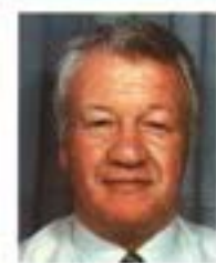
Billy Bingham (Northern Ireland)

Born on 5 August 1931. Played amongst other clubs for Sunderland, Everton and Luton Town. Bingham began his coaching career with Linfield. Following this he became coach of the Greek national team. With various stops on the way (including a spell at Everton) he once again for the second time after 1967 took over the Northern Irish side and qualified with them for both the 1982 and 1986 World Cups. His first commission in the framework of the Technical Study Group was in 1983 on the occasion of the WYC in Mexico.