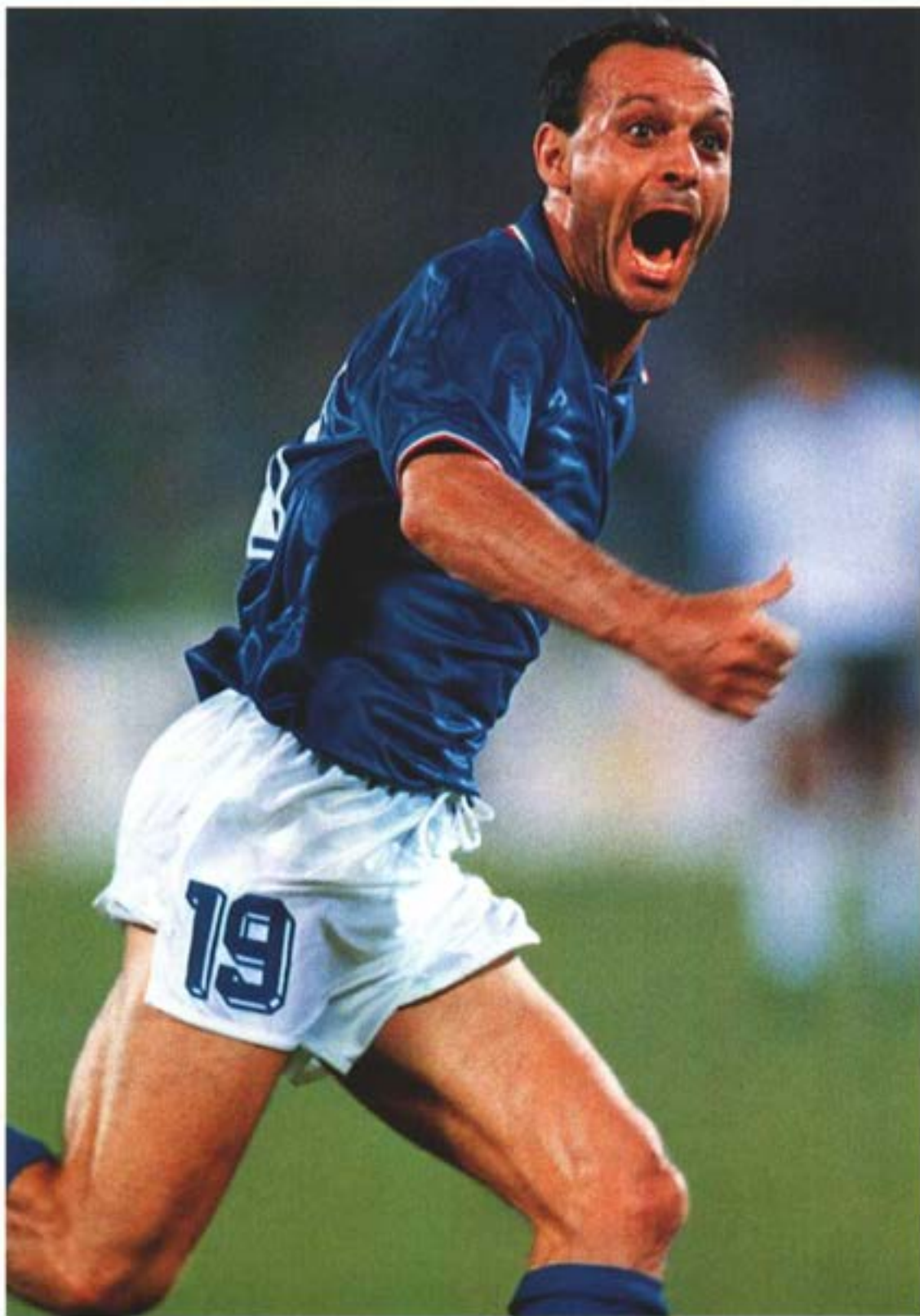
Salvatore Schillaci, Italy's new football hero.